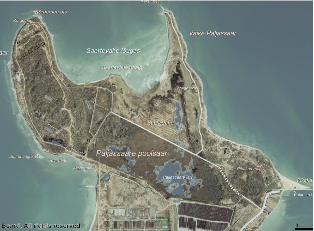
Finding the abandoned buildings