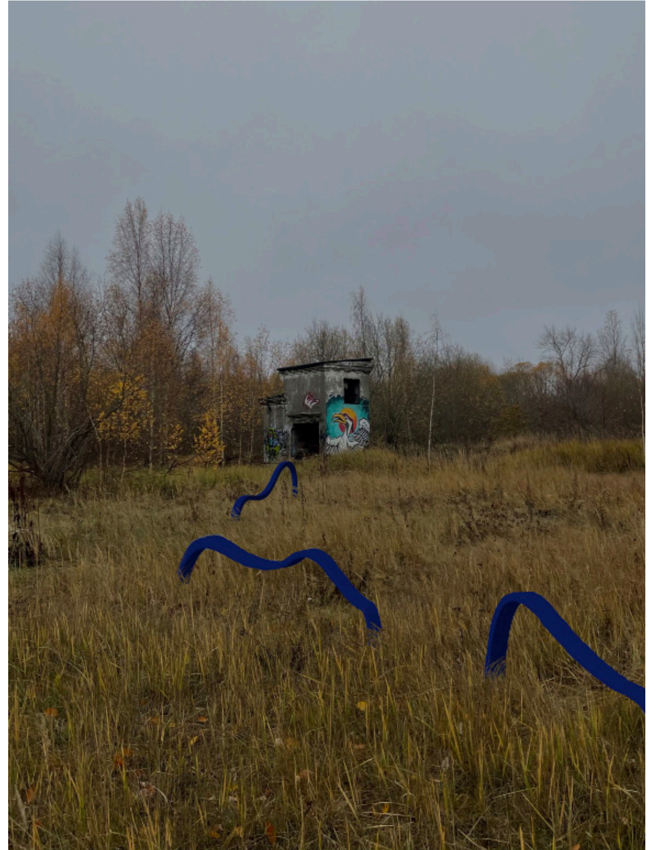
Making a new path that connects all abandoned buildings. Stitching as a method.